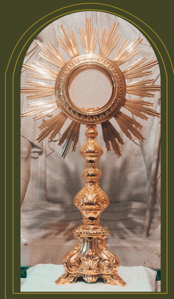
The Roman Catholic Diocese of Springfield-Cape Girardeau